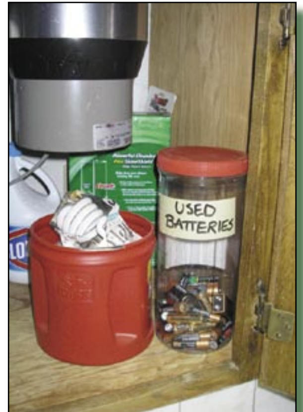
Under-sink storage is handy for used batteries and CFLs.