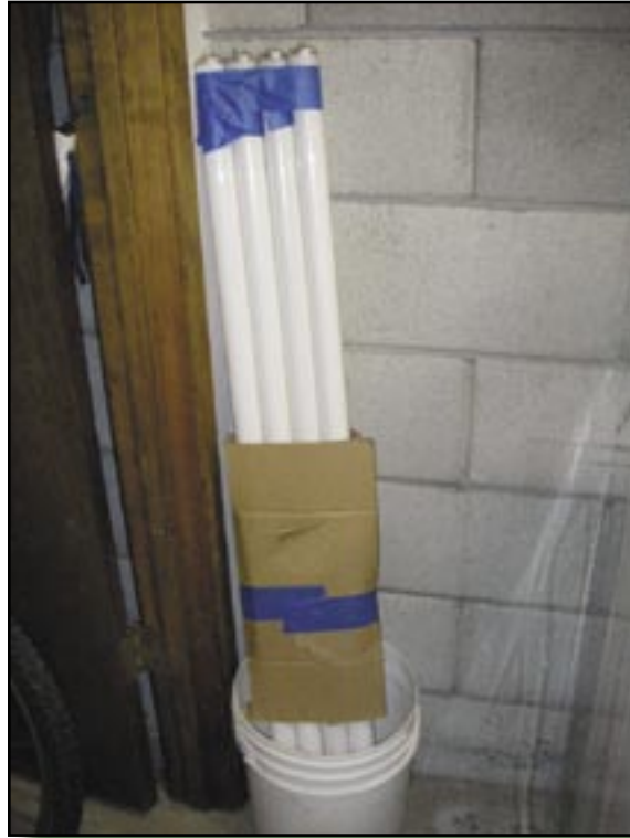
Stash fluorescent tubes in a corner or closet until you make a trip to the RRF.

and other sharps into an approved, red sharps container (available from your pharmacy or online). Drop-off sites are Bruce's Medical Plaza, Horsnyder's Pharmacy, and Westside Pharmacy. The City Police Station has a drop-off for medications only . The RRF accepts medications and needles on Saturdays only, 7:30-3:30.